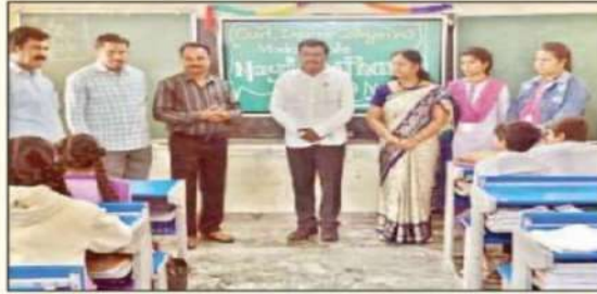
నయూచేతన కార్యక్రమంలో ఉపాధ్యాయులు, విద్యార్థులు