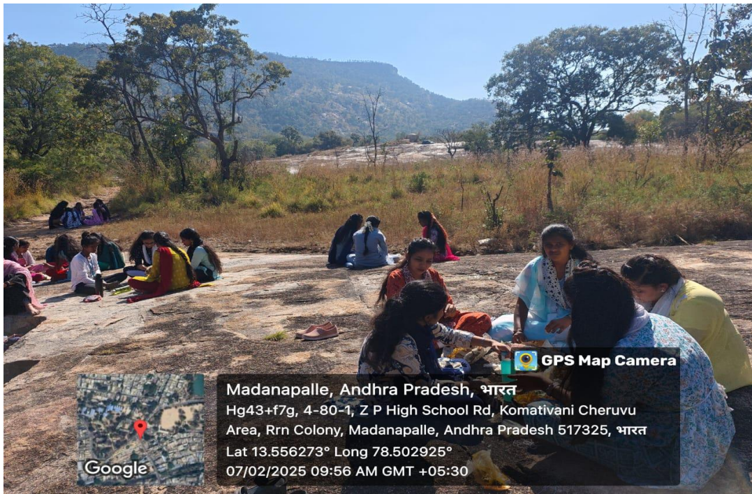
Having Breakfast @ Talakona