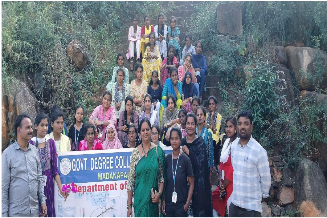
Kalyani Dam, Tirupati