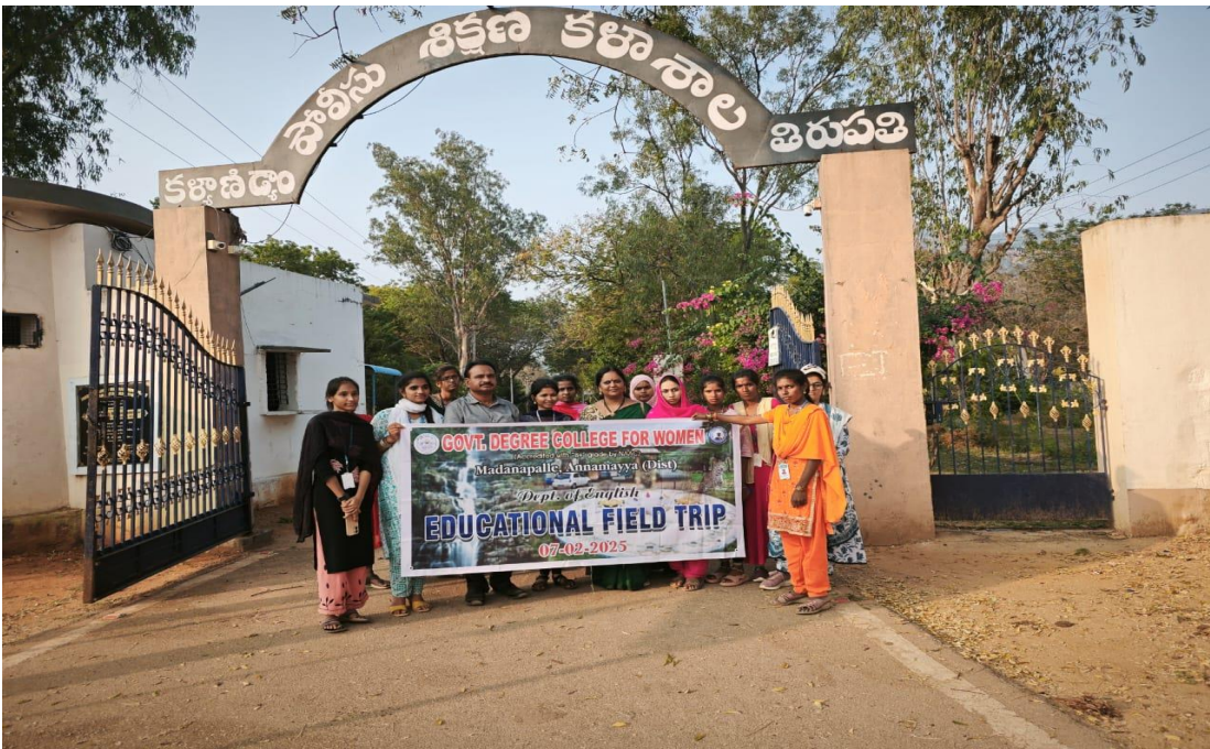
Police Training Centre, Tirupati